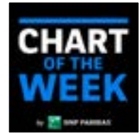
CHART OF THE WEEK