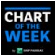
CHART OF THE WEEK