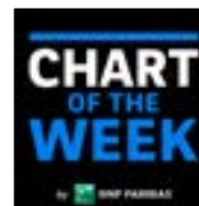
CHART OF THE WEEK