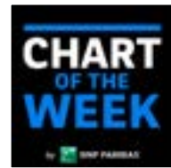
CHART OF THE WEEK