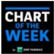
CHART OF THE WEEK