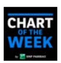
CHART OF THE WEEK