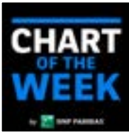
CHART OF THE WEEK